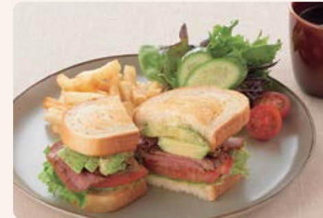
燒牛肉牛油果三文治 $118 Roasted Beef & Avocado Sandwich