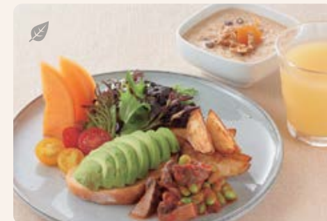
素食早餐 $118 Green Breakfast

班尼迪蛋、烤大啡菇、德國香腸、精選薯餅、精選麵包、鮮果穀麥(冷)、新鮮水果 Egg Benedict, Baked Portobello, German Sausage, Selected Potato Croquette, Selected Bread, Fresh Fruit Muesli (Cold), Fresh Fruits