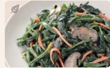
芝麻醬拌菠菜冬菇 $98 Spinach & Shiitake Mushroom with Sesame Dressing 300g