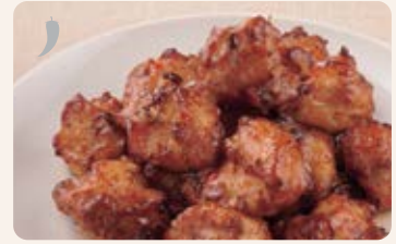
梅子醬豚肉 $108 Pork with Plum Sauce 4 portions