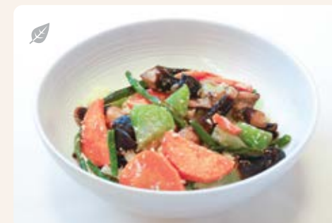
鹽麴烤蔬菜 (大) $38 Shio Koji Roasted Vegetables (Large)