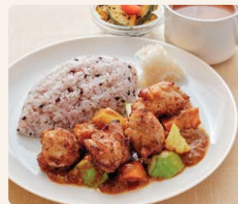
牛油雞肉雜菜咖喱飯 $108 Butter Chicken Curry Rice with Vegetables