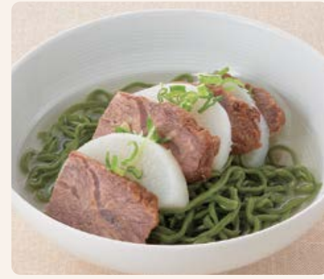
清湯牛面肉海帶麵 $138 Beef Cheek with Wakame Noodles