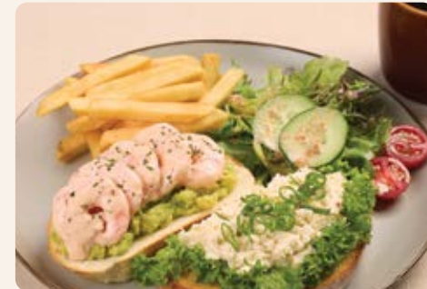
牛油果醬蝦肉蟹肉開面三文治 $118 Open-faced Avocado Sauce Shrimp & Crabmeat Sandwich