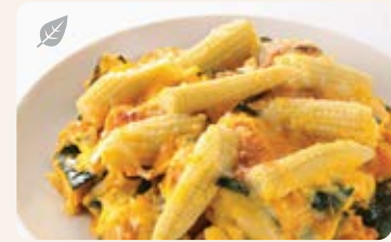
蔬菜醬汁煮雜菌 $98 Assorted Mushroom in Vegetable Sauce 300g