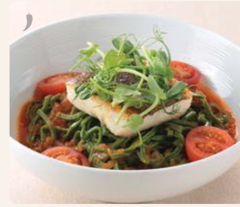
番茄比目魚海帶麵 $138 Panfried Halibut in Cherry Tomato Sauce with Wakame Noodles

製作需時15-20分鐘 Food Preparation Takes 15-20 Minutes