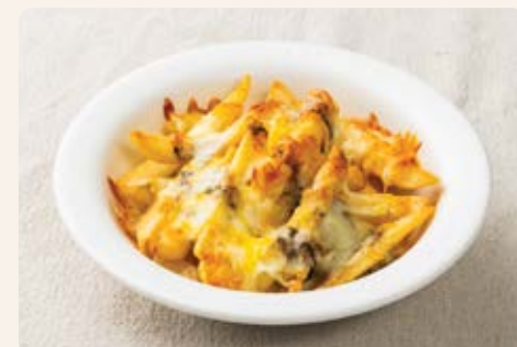
芝士黑松露薯條 $68 Cheese French Fries with Black Truffle Dressing