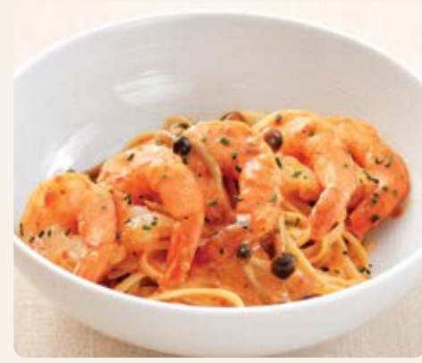
蟹肉番茄忌廉醬虎蝦意粉 $138 Tiger Prawn Linguine with Red Snow Crab & Tomato Cream Sauce

餐單食品可能含導致過敏的成份，如蛋類、堅果類、奶類及麩質等。如顧客有食物過敏或其他飲食有關的飲食限制，請於點餐前向職員查詢。 Items in our menu may contain food allergens, e.g. eggs, nuts, milk, gluten. For customers with food allergies or other health-related dietary restrictions, please contact our staff before placing order.