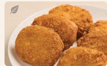
南瓜薯餅 $98 Pumpkin Potato Croquette 4 portions