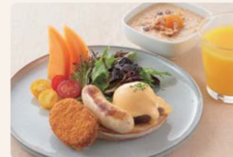
全日早餐 $118 All Day Breakfast