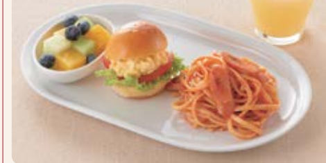
迷你意粉套餐 $78 Mini Linguine Set

供應十二歲或以下小童 For Children Aged 12 Or Under