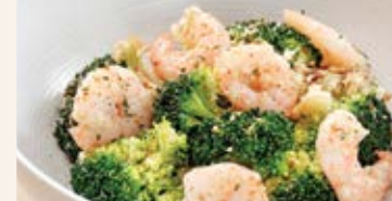
甘筍忌廉汁烤南瓜珍珠筍 $98 Baked Pumpkin & Baby Corn in Carrot Cream Sauce 300g