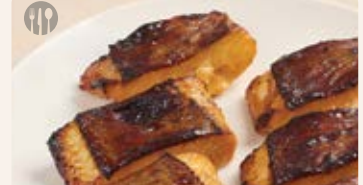
醬油燒比目魚 $128 Soy Sauce Grilled Halibut 4 portions