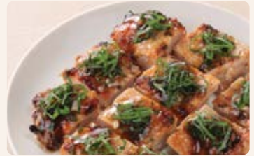
甜椒醬炸雞 $108 Fried Chicken with Sweet & Chilli Sauce 4 portions