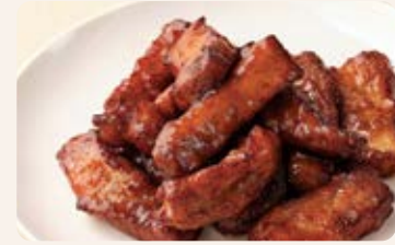
雜菌蔬菜厚燒玉子 $98 Assorted Mushroom and Vegetable Omelette 4 portions