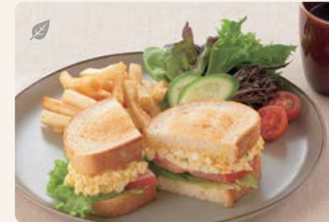
日本蛋沙律三文治 $85 Japanese Egg Salad Sandwich

配炸薯條及季節沙律 Served with French Fries & Seasonal Salad