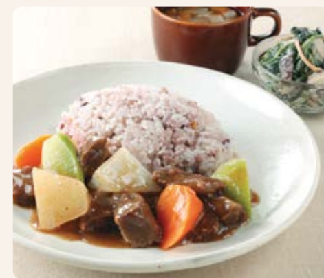
燒汁燴蘿蔔牛肋條飯 $108 Stewed Radish & Beef Rice with Gravy Sauce

包括餐湯及自選冷盤1款，可選配十六穀飯 / 白飯 / 鹽麴烤蔬菜 Include Daily Soup, Choice of 1 Cold Deli & Choice of 16 Grain Rice / White Rice / Shio Koji Roasted Vegetables