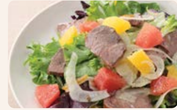
香橙茴香牛肉沙律 $98 Beef Salad with Orange and Fennel 300g

茴香奶油雙花蝦 Broccoli Cauliflower Shrimps in Fennel Cream Sauce 採用肉質爽嫩的蝦肉、配以西蘭花及椰菜花，混合新鮮茴香製成的自家製奶油汁，味道層次豐富。 Tender shrimp with broccoli and cauliflower, served in a rich fennel cream sauce for a layered, aromatic flavour.