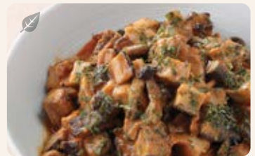
梅子醬照燒雞肉 $108 Teriyaki Chicken in Plum Sauce 4 portions