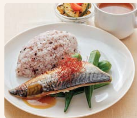
柚子醬油烤鯖魚飯 $108 Baked Mackerel Rice with Yuzu Soy Sauce